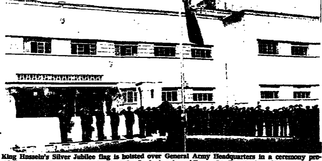
King Hussein's Silver Jubilee flag is hoisted over General Army Headquarters in a ceremony presided over by Commander-in-Chief of the Jordanian Armed Forces Lt-Gen. Zeid Ibn Shaker Monday. Jubilee flags were also hoisted over divisional command headquarters.

The celebrations, which will last nine months, will reach their climax on Aug. 11 -- the 25th anniversary of King Hussein's accession to the throne.